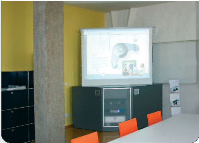
ESPIRO with extended projection screen